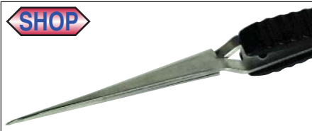
Long Straight Tweezers