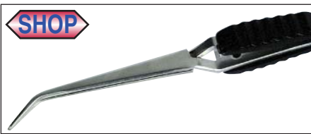
Long Bent Tweezers