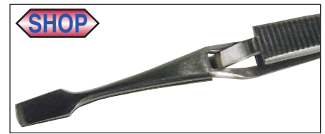
Straight Flat Square End 5mm Wide