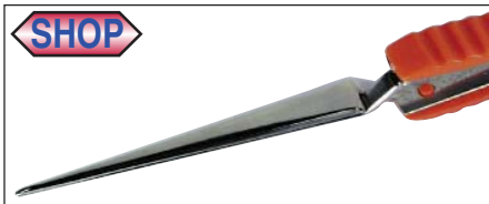
Pointed Self Closing Long Straight