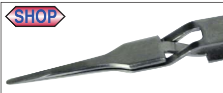
Reverse 2 Flat Round Tip Smooth Sides