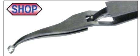
Chip Holding Curved Fine Micro Tip