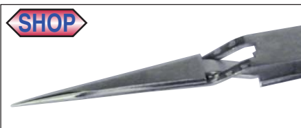
Reverse 3 Fine Round Points For Assembly