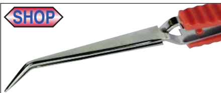
Long Bent Tweezers