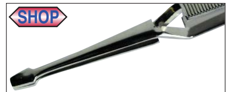
Strong With Square Ends Deep Serrated