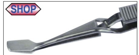
Bent Flat Square End 5mm Wide