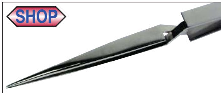
Pointed Self Closing LD Long Straight