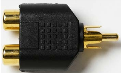
Model 6882 RCA (F/M/F) Adapter