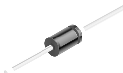
DO-35 Glass case COLOR BAND DENOTES CATHODE